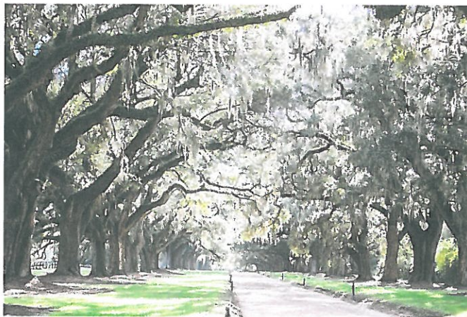
Boone Hall Plantation

Charleston is home to historical treasures, especially when it comes to old Southern plantations, like the famous Boone Hall Plantation and Gardens. You may recognize the sweeping willow trees and moss-draped avenue of oaks from The Notebook . To say this is one of the most popular wedding destinations in the U.S. is an understatement, countless couples (like Blake Lively and Ryan Reynolds) flock to Boone Hall each year. If you find yourself wanting to wed here, your best bet is to reserve early.