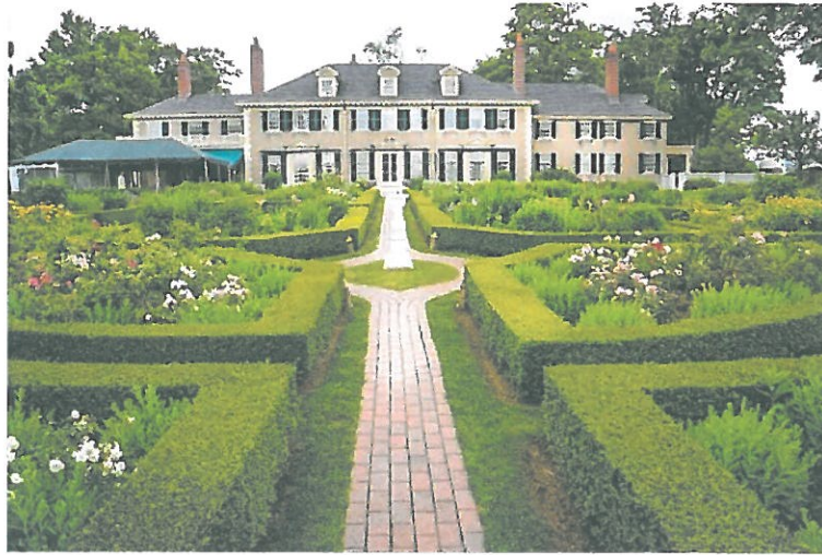
The Lincoln Family Home in Manchester, VT

Company (the largest manufacturing company of the 20 th century), “Hildene,” a Georgian Revival mansion in the scenic, but sleepy town of Manchester, Vermont, was his summer home. Up until 1975, it remained a private residence to Lincoln descendants. Now, this beautiful historic setting can be the location for your wedding.