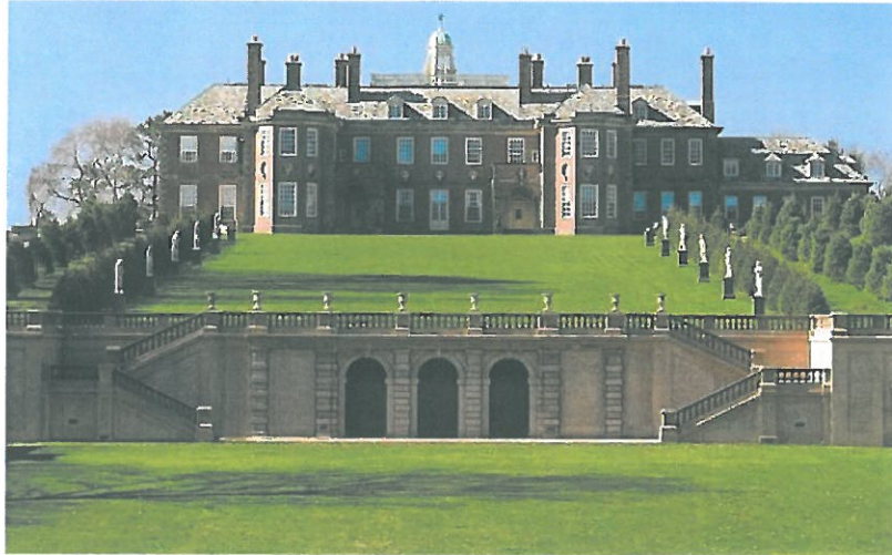
The Crane Estate in Ipswich, MA