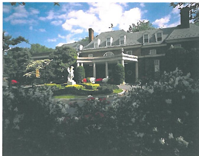
Hillwood Mansion in Washington, D.C.

Marjorie Merriweather was a well-known American socialite in the early 1900s and the owner of General Foods, Inc. She also built Mar-a-Lago, which is now infamously owned by Donald Trump. “Hillwood,” the museum that was once her main estate in north west D.C., is much less controversial. The 1920s mansion sits on acres of meticulously maintained gardens and terraces. Inside, guests will find the largest collection of Russian art and Fabergé eggs that exists outside of Russia, accompanied by Louis XVI neoclassical antiques. Hillwood is a sought after wedding venue, to say the least, and typically has a long queue for weddings. The wait however is worth it.