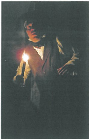
Cherry Hill hosts its annual "Murder Tours" on October 27-28.