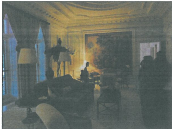
An appetition on the left appetizes during a ghost tour at The Mount.

Most paranormal happenings can be easily explained, they told me. A door opens because of a faulty hinge; neighbors' voices carry from next door; tree branches cast eerie shadows inside the house. About 10 percent of occurrences elude explanation. In those cases, they said, they ask a priest to bless the house and give the homeowner peace of mind.