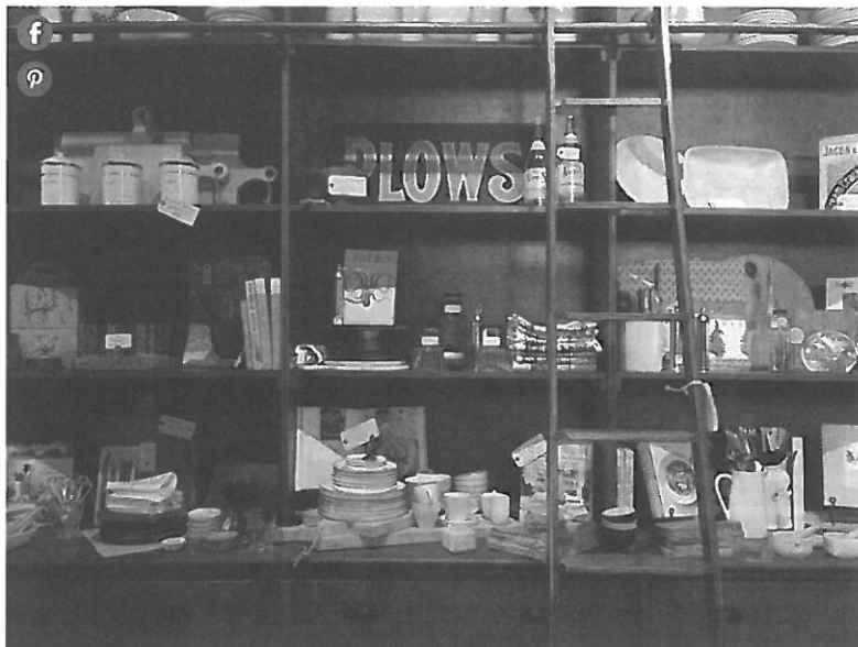
There's a conspicuous dearth of hammers at Hammertown—but plenty of other souvenirs

Shop The well-curated Farm and Home sells a range of table linens, waxed oil totes, and woolen throws and blankets. A few blocks away, Hammertown stocks furniture alongside French totes, hand-poured candles, and melamine plates. Asia Galleries has a nice collection of Japanese antiques and Buddhist sculptures.