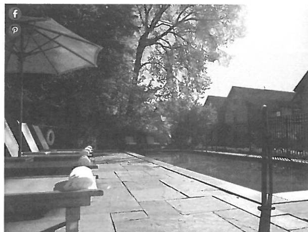
Home away from home Porches Inn

Stay Steps from MASS MoCA, and spread over six Victorian row houses, the 47-room shabby chic Porches Inn offers a summer camp feels with antique rocking chairs and an outdoor pool.